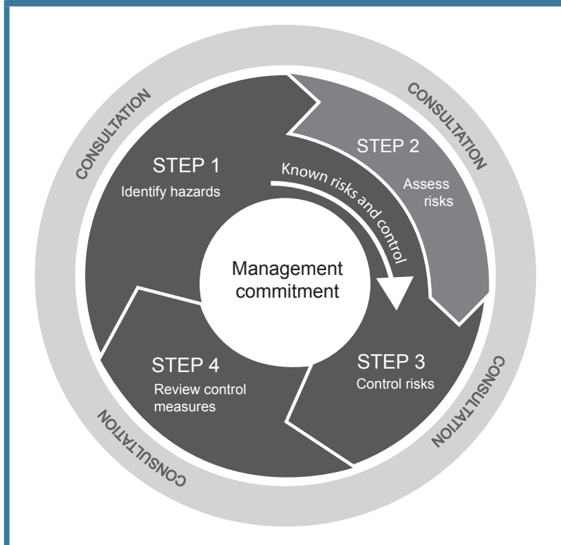
FIGURE 1: The risk management process

Many hazards and their associated risks are well known and have well established and accepted control measures. In these situations, the second step to formally assess the risk is unnecessary. If, after identifying a hazard, you already know the risk and how to control it effectively, you may simply implement the controls.